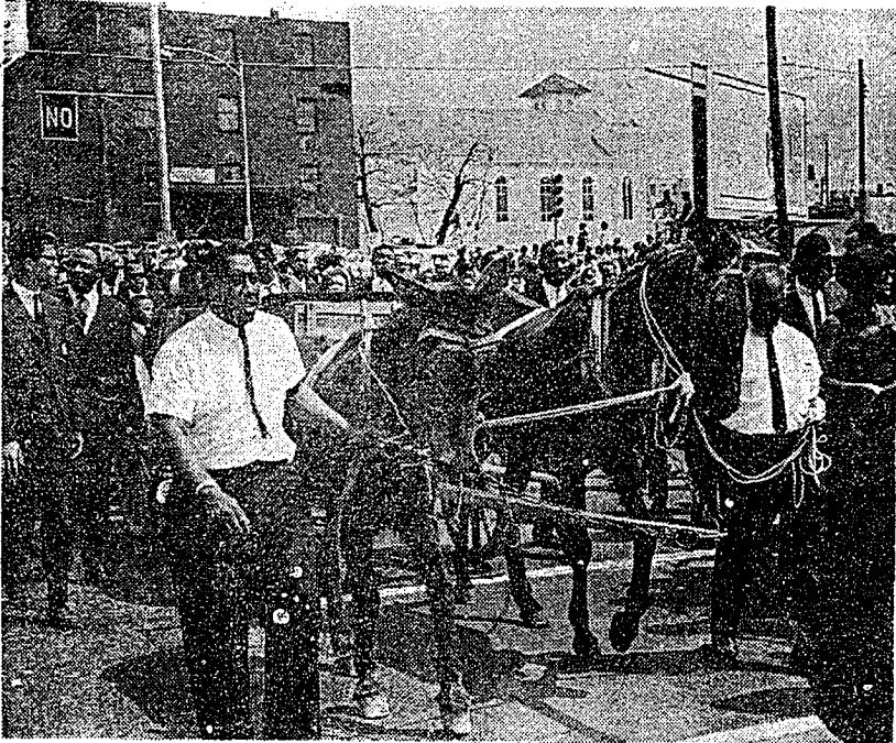
AND THIS SHALL BE A SIGN — The coffin bearing the martyred Dr. Martin Luther King Jr. is borne on a faded green farm cart, by mules to symbolize the poverty and degradation he gave his life to help bring to an end. It was the symbol he himself had chosen for next month's scheduled Poor People's March on Washington.